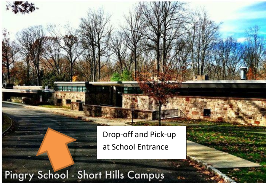
Image of the School

** There might be other camps operating at the same entrance. Please make sure your child goes to the International Ivy counselors**